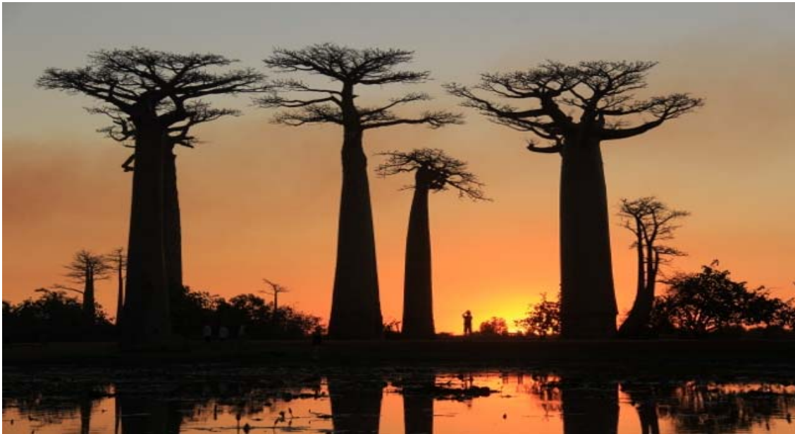
Sunset Alley of Baobabs

This is meant to be a "free and easy" adventure trip. Participants should be relatively fit, with a good sense of humour, and above all, have the right attitude for close travel with others through possibly some trying times. Most definitely, this is not a trip for prudes, whiners, fuss-pots, and other similiarly assorted types! We had a couple of those before and it wasn't pleasant for us or them. Although every effort will be made to stick to the given itinerary, ground conditions may change and cause some disruption and/or deviation from the norm. Otherwise, have fun!