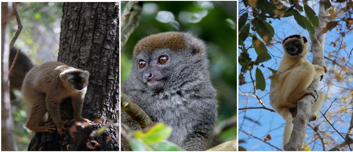
Difference species of Lemurs

Day 1 KLIA-Bangkok-Antananarivo: Meet at KLIA for flight TG416 to Bangkok at 1320PM arriving 1430PM. Connect flight MD011 to Antananarivo at 1730pm, arriving 2205PM. Check in hotel. Overnight (ON) Antananarivo.