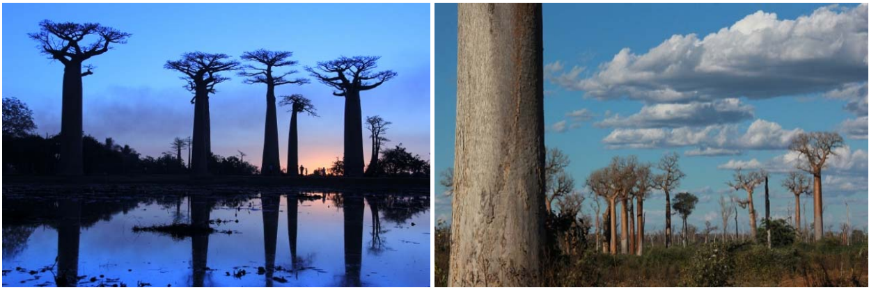
Beautiful Wild Baobab Trees

Day 7 Morondava - Manja : Full day off road drive from Morondava to the Mangoky River on the RN9. We will pass through the dry savannah with giant baobab trees before reaching the town of Manja. Arrival in the afternoon. Dinner and camping on the sandy beach.