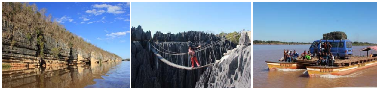
Bekopaka/ Grand Tsingy / Ferry crossing

Day 4 River Trip-Bekopaka (4 HOURS BOAT + 5 HOURS DRIVE) : Half Day on the river by watching several water birds, lemurs and bats before reaching Belo Tsiribihina. After lunch on board, drive off road to Bekopaka in the afternoon. O/N Bekopaka