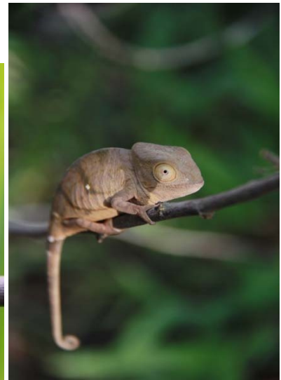
Various species of Chameleons

Day 9 Ifaty-Ranohira : Morning free & easy on the beach. We start drive to Tuléar around late morning. After lunch in town, drive towards Isalo National Park for the rest of the afternoon along the RN7. O/N Ranohira.