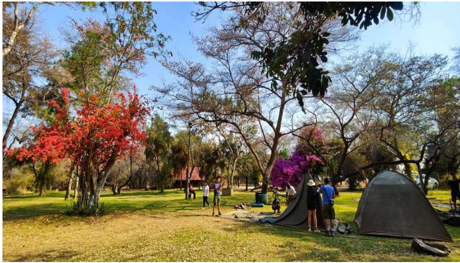
Set up tent at beautiful campsite

Day 9 Etosha National Park (East): On this morning, after breakfast and pack up the tents and have a full day game drive inside the park. While we drive from one campsite to the other, nestled within a former German fort, Namutoni Camp exudes a distinct ambiance.