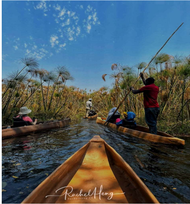
Mokoro Boat Ride

The Mahango Game Reserve is characterised by woodlands, vast floodplains and the Kavango River. It is home to a reported 99 species including a large number of elephant, lion, leopard and a variety of antelope including the red lechwe, sable and roan. This park is an excellent destination for avid bird watchers boasting over 400 species and provides the perfect location for seeing crocodile and hippo in the Kavango River. O/N Mahangu Safari Lodge. (All meals covered)