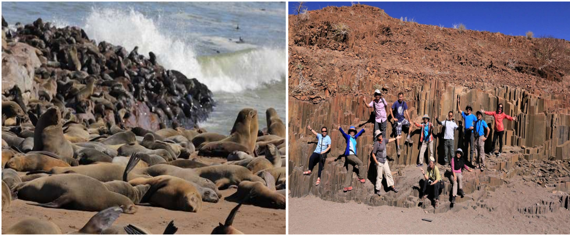
Fur Seals/ Group enjoy the superb nice weather

Day 7 Twyfelfontein : Heading for Damaraland along the Skeleton Coast we stop at the seal colony of Cape Cross where we may have a close encounter with thousands of fur seals. We continue to the small town of Uis for supplies. Uis is an old mining town and a good place to buy semi-precious stones.