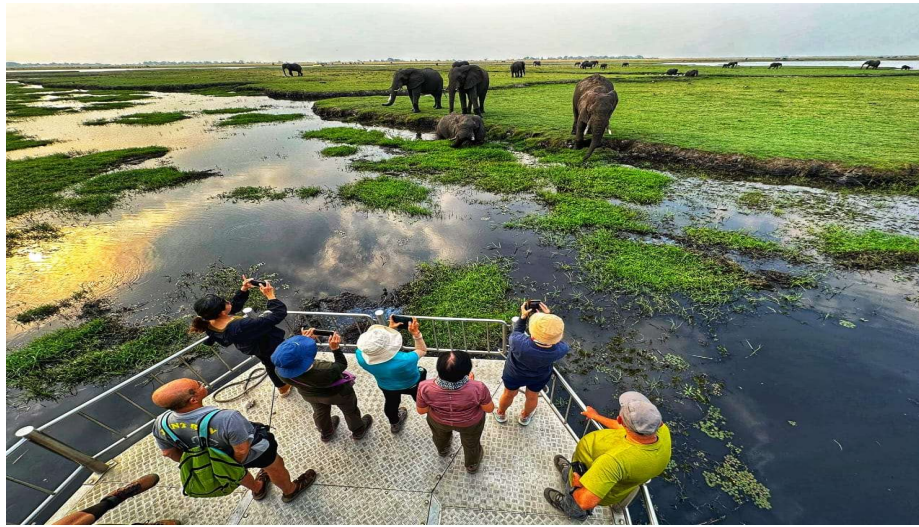
Chobe National Park

Day 13 Chobe National Park II : The Chobe National Park, which is the second largest national park in Botswana and covers more than 10,000 km 2 , has one of the greatest concentrations of game found on the African continent. Its uniqueness in the abundance of wildlife, and the true African nature of the region, offers a safari experience of a lifetime. It is particularly well known for the large amounts of elephants, which are said to be the largest in body size of all living elephants.