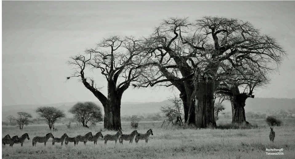
Zebra during sunset

Day 5 Amboseli NP : After breakfast drive to Amboseli National Park arrive in time for lunch and short rest at Sentrim Amboseli camp. We will then go out for the afternoon game drive to enjoy game viewing against the majestic backdrop of snow-capped Mt Kilimanjaro. O/N Amboseli. (All meals covered)