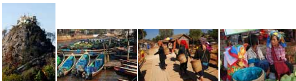
Mt Popa/Inlake Lake/Pak Oo folks/Pindaya Market

Day 5 Bagan: After breakfast, short visit to the local Nyang Oo market. After that, we proceed with our half-day cycling tour in Bagan. Highlights include historic pagodas and temples such as Shwezegon Pagoda – the prototype for later Myanmar pagodas built by King Anawryetha, Ananda temple - a master piece of King Kyansittha, Kyansittha Umin (cave) - a tunnel with an interesting feature of paintings of mongo warriors and Htilominlo Temple noted for its plaster carvings. After lunch, continue sightseeing other places by car, such as Thatbyinnyu temple - the highest building in the Bagan plain and Dhamma Yangyi temple - the most massive temple. O/N Bagan.