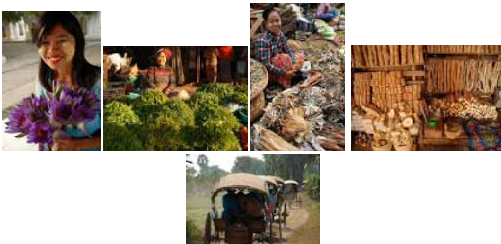
Local people in market

Day 8 Biking Tour & short excursion in Inle : After breakfast, bike from Nyaung Shwe around 30 minutes to Red Mountain Winery. Group can free test variety of wine taste. Then continue to Mine Thauk Village (about 45 minutes) and go to Thalao (about 45mins) and take boat go through and lunch stop. After lunch do sightseeing on the lake around at Ywama and Nanpam village and back to Nyaung Shwe.. O/N Nyaung Shwe.