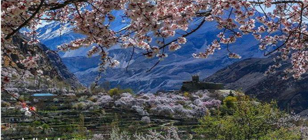
Spring in Pakistan