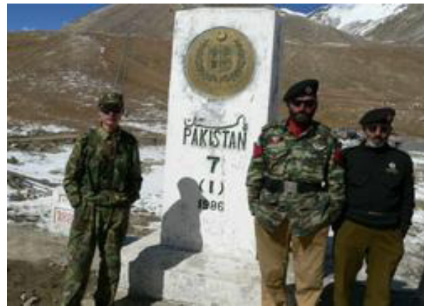
Near the top of KKH / Pakistan China Border Stone Marker