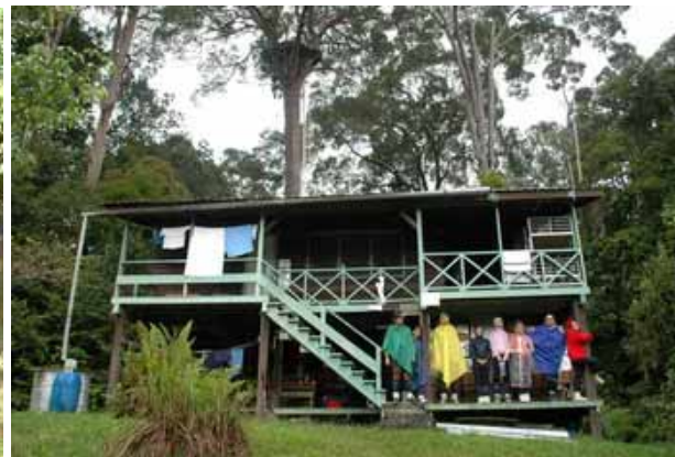
Start at Agathis Camp / Camel Trophy Camp

Day 4 Ginseng Camp: Its 9km 4hr trek to Lobah Camp to replenish drinking water. We pass through the previous day beautiful heath forest with moss-covered ground, abundance of wild orchids and pitcher plants - a photographer's paradise. There are virtually no trees with diameter exceeding two inches as the soil is thin and nutrients deficient. We are now in the midst of what is know as the "Lost World of Sabah". From Lobah, it is 2.5km 1hr to the spectacular 7-tiers Maliau Falls. Daredevils can swim accross the 50 meter pool at the base of the falls. We backtrack 4.5km 1hr to the Ginseng junction and then another 1km 40min to Ginseng Camp. This is a newly constructed raised camp with excellent facilities - flushed toilets, cold showers, big kitchen and dining areas, bunk beds with mattresses and generator lights.