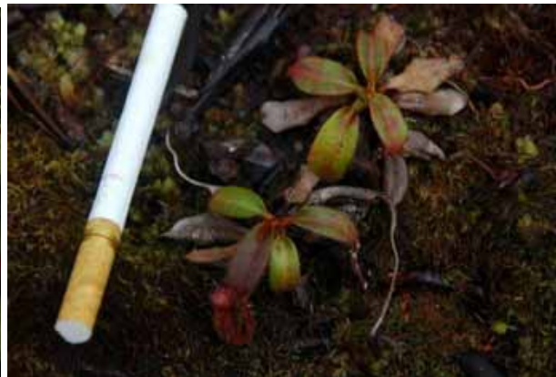
Ginseng Camp sleeping area / Tiny pitcher plant species