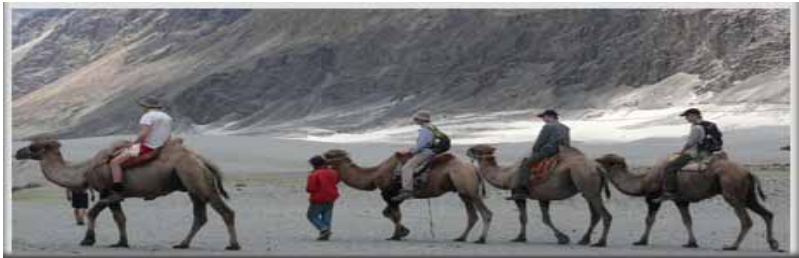
Nubra Valley with double hump camel

Day 6 Aug 16 Nubra Valley: After breakfast at camp, Visit the main village which is Deskit which has a regular bazaar and Gompa. From Deskit the town proceeds down the Shayok to small village of Hunder (3,048 mts). Afternoon return back to Leh over Khardungla savouring the spectacular scenery once again. On arrival check in hotel later you may want to visit Tibetan market and the Leh bazaar for last minute souvenirs.