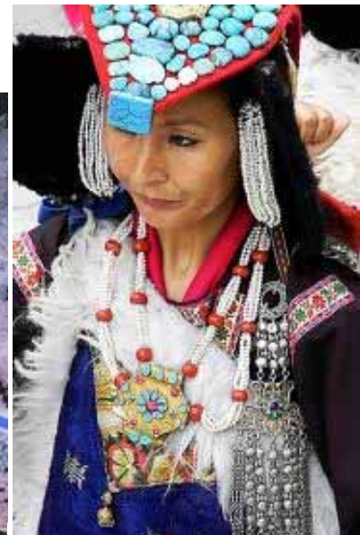
Leh Monastery/Along the way/Leh Local lady