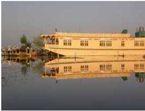
Morning floating market & comfortable bed at Nagen Lake/Nice houseboat

Day 11 Aug 25 Gulmarg Excursion: After breakfast at Houseboat, depart by surface for Gulmarg. Arrive at Tanmarg, base of mountain and board jeeps to climb 12 Kms to Gulmarg- one of the most beautiful summer resort in the valley. It is also popular for its golf course during summer season and as a ski resort during the winter season. Enjoy the splendor of nature and the snowy mountains. Optional one can enjoy Gondola ride (Cable car) from Gulmarg to Khalinmarg on extra cost (optional). In the late afternoon return back to Srinagar and transfer to your houseboat. Dinner and Overnight at Houseboat.