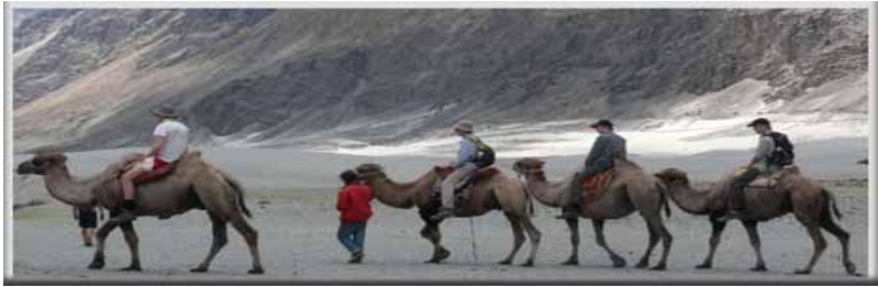
Nubra Valley with double hump camel

Day 6 Aug 20 Nubra Valley: After breakfast at camp, Visit the main village which is Deskit which has a regular bazaar and Gompa. From Deskit the town proceeds down the Shayok to small village of Hunder (3,048 mts). Afternoon return back to Leh over Khardungla savouring the spectacular scenery once again. On arrival check in hotel later you may want to visit Tibetan market and the Leh bazaar for last minute souvenirs.