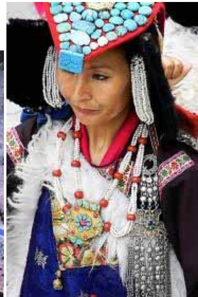
Leh Monastery/Along the way/Leh Local lady

Ladakh: “More Tibetan than Tibet”, “Moonland”, “the Last Shangrila” are all romantic names given to Ladakh. With its stunning barren rugged terrain and untouched Tibetan culture, it is certainly a beautiful place – befitted all the above & much more. The height of these ranges of the Western Himalayas prevents rain clouds from crossing into Ladakh and as a result, Ladakh receives only about 2 inches (5cm) of rain per year. The aridity of the area is immediately apparent to the visitor, with long vistas of stark mountains and valleys with only a few oases of green.