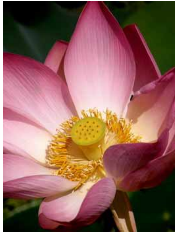
On the way to Gulmarg/Kashmiri boy/Lotus around the lake

Day 10 Aug 24 Srinagar: . After breakfast proceed with tour of world famous Mughal Gardens visiting the Nishat Bagh (The garden of pleasure) and Shalimar Bagh (Abode of love) and visiting handicrafts center. Return back to houseboat for lunch. Afternoon, enjoy your ride on a Kashmiri gondola known locally as Shikara. This interesting ride takes you through the lake where you can find natives engaged in farming on water and carrying their produce on their sikara to market or their houses. The ride also offers spectacular Himalayan mountains mirrored in the lakes. In the evening return to Houseboat.