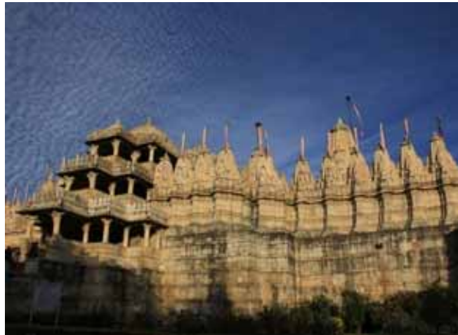
Mehrangarh fort, Jodhpur/ Jain Temple, Ranakpura

Day 1 Fly to Delhi: Fly to Delhi by Malaysia airlines (MH) at 1850pm via MH190, arriving 2150PM (OR Malindo airlines OD205 at 1805pm from KLIA, reached 2105PM). Transfer to hotel. Overnight (ON) Delhi.