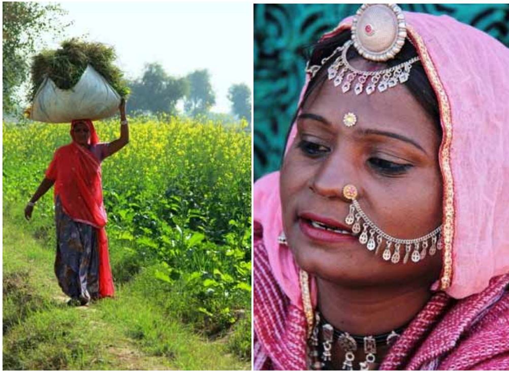
Masturd season/Rajasthani ladies

Day 5 Jaisalmer: After breakfast, walk around Jaisalmer Fort, the monolith of stone, built in 1156 atop the 80 m high Trikuta hill, is the only raised feature in a flat desolate area. We will meander through alley ways lined with havelis sporting great intricate hand - carved sand stone latticed balconies and archways. After lunch around 1300 hour drive to the start point of our camel safari through the villages to sand dunes. ON Khuri.