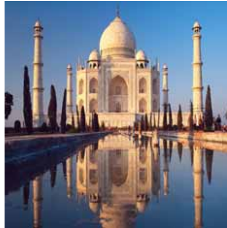
Hawa Mahal/Taj Mahal

Day 13 Back to Delhi: Early morning, visit Taj Mahal and Red Fort. Taj Mahal is one of the most beautiful masterpieces of architecture in the world. Built entirely by white marble, Taj Mahal is regarded as one of the eight wonders of the world. Some Western historians have noted that its architectural beauty has never been surpassed. After lunch drive to Delhi ON Delhi.