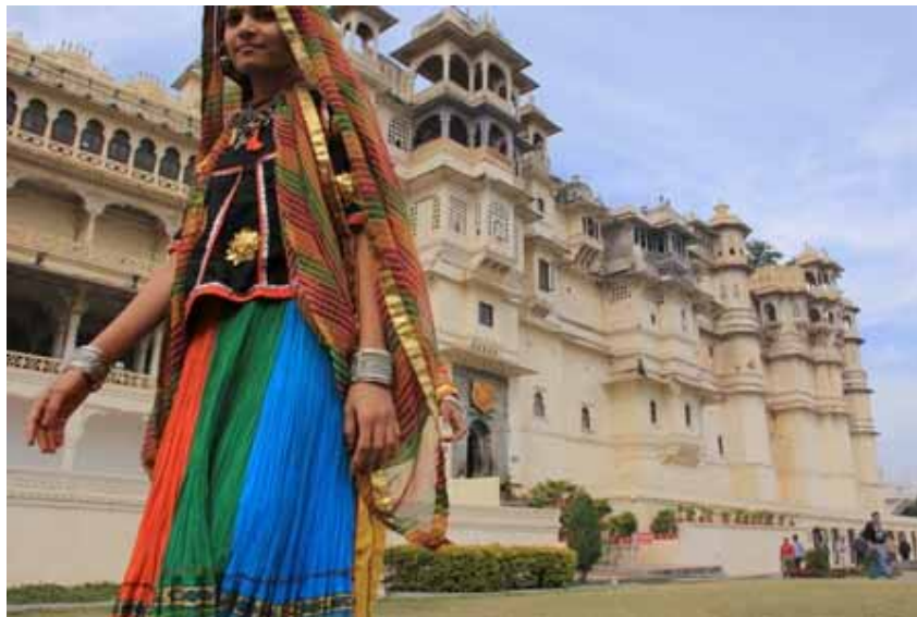
City Palace, Udaipur

This is meant to be a "free and easy" adventure trip. Participants should be relatively fit, with a good sense of humour, and above all, have the right attitude for close travel with others through possibly some trying times. Most definitely, this is not a trip for prudes, whiners, fuss-pots, and other similiarly assorted types! We had a couple of those before and it wasn't pleasant for us or them. Although every effort will be made to stick to the given itinerary, ground conditions may change and cause some disruption and/or deviation from the norm. Otherwise, have fun!