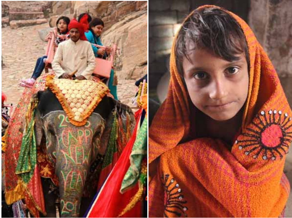
Elephant ride at Amber Fort/ Rajasthani Boy

Day 10 Pushkar-Jaipur (140km, 4hr+): In the morning visit the Brahma temple and the holy lake. On completion drive to Jaipur. Jaipur is the capital city of Rajasthan. Also known as Pink City. One of the oldest planned cities. ON Jaipur