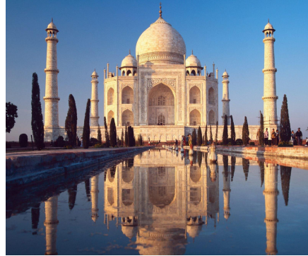
Hawa Mahal/Taj Mahal

Day 13 Back to Delhi: Early morning, visit Taj Mahal and Red Fort. Taj Mahal is one of the most beautiful masterpieces of architecture in the world. Built entirely by white marble, Taj Mahal is regarded as one of the eight wonders of the world. Some Western historians have noted that its architectural beauty has never been surpassed. After lunch drive to Delhi ON Delhi.