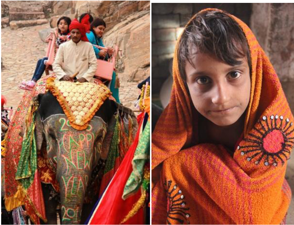
Elephant ride at Amber Fort/ Rajasthani Boy

Day 10 Pushkar-Jaipur (140km, 4hr+): In the morning visit the Brahma temple and the holy lake. On completion drive to Jaipur. Jaipur is the capital city of Rajasthan. Also known as Pink City. One of the oldest planned cities. ON Jaipur