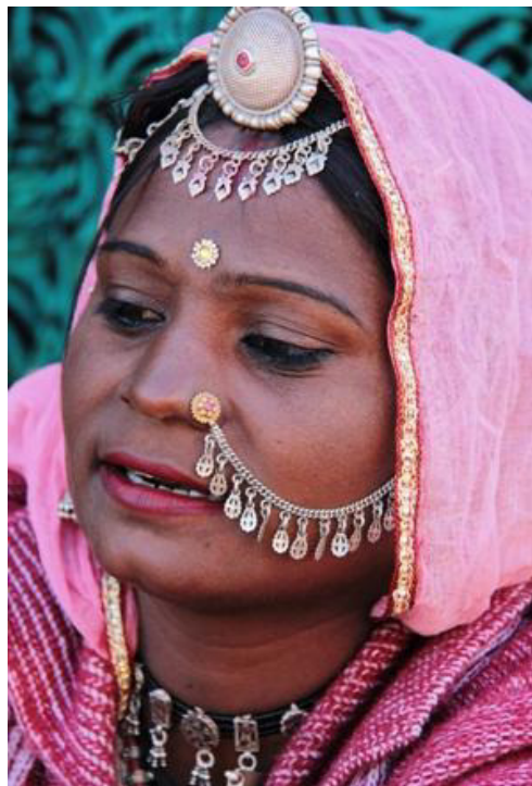
Masturd season/Rajasthani ladies

Day 5 Jaisalmer: After breakfast, walk around Jaisalmer Fort, the monolith of stone, built in 1156 atop the 80 m high Trikuta hill, is the only raised feature in a flat desolate area. We will meander through alley ways lined with havelis sporting great intricate hand - carved sand stone latticed balconies and archways. After lunch around 1300 hour drive to the start point of our camel safari through the villages to sand dunes. ON Khuri.