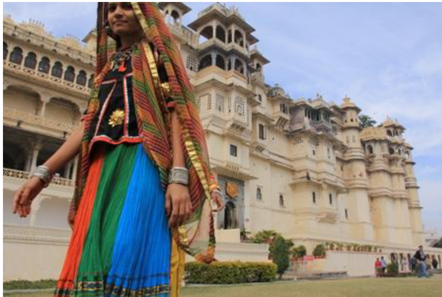
City Palace, Udaipur

Rajasthan is the land of Rajput Kings, a group of warrior clans, who have controlled this part of India for 1000 years. It is a colorful state with stunning and elegant Palaces dot the desert landscape and battle-scarred fortresses appear on every hill like sentinels of the past. It is full of Lakes, Sand dunes, Wild Life Sanctuaries and Beautiful Temples. Rajasthan still retains an elusive fairy-tale character. It is a land where tales of valour of its medieval Rajput warriors are still sung by its traveling bards. It is also known for tradition of craftsmanship with a highly developed aesthetic sense.