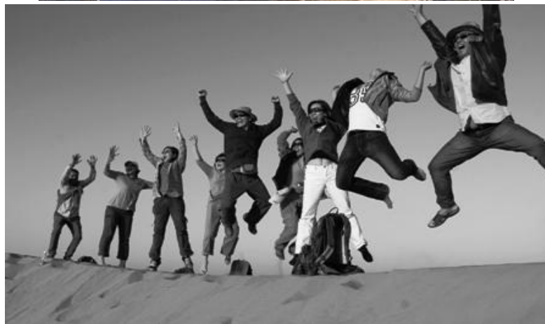
Jodhpur Mahrangarh fort & Blue City/ Group 2014 have fun at Khuri Sand Dunes

Day 8 Udaipur: Spend the rest of the day exploring this charming lake city by car. Wander through the opulent City Palace grounds and the museum, which are a testament to the valour and chivalry of the Mewar rulers. Visit the Jagdish temple on the shores of Lake Pichola. The breathtaking beauty of the lakes- Pichola & Fateh Sagar truly make Udaipur an oasis in the desert. Return to hotel after city drive. Dinner & overnight stay at the hotel. ON Udaipur.