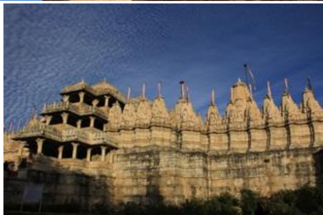
Mehrangarh fort, Jodhpur/ Jain Temple, Ranakpura