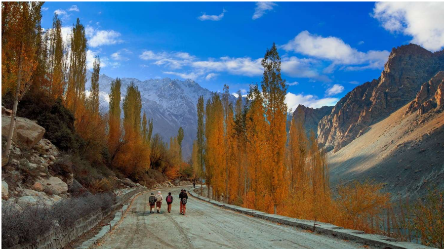
Autumn in Pakistan

Flight ticket is based on today's PIA airlines fare excluded taxes approximately Rm2500 and will be updated if there is any changes. (NOTE : Please DO NOT purchase air ticket until YONGO advise AFTER trip is confirmed to run). Expected seat will fill up quick, as such we shall base on 1st come 1st serve basis for seat confirmation. Please register and confirm your seat by email rachelheng123@gmail.com or whatsapp her +6012-352 0868.