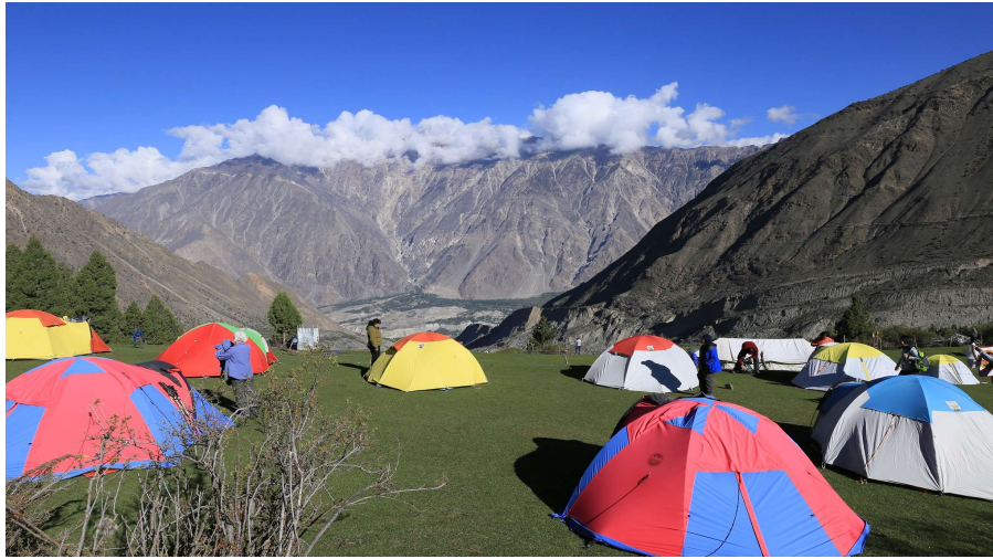
Hapakun Camp site view