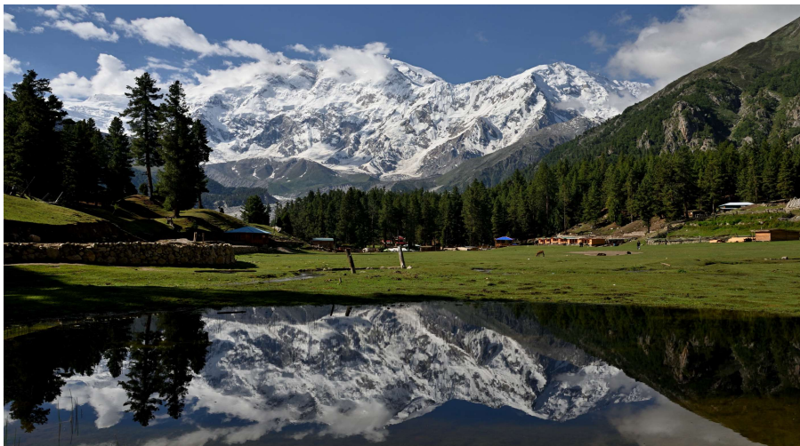
Stunning view from Fairy Meadow

Drive to Raikot bridge 56KM (1.5 hour) transfer to 4x4 jeeps, which takes us to Tato village (1 hr) and trek to Fairy Meadows 2-3hrs, 5.5km, 640m ascent, Altitude 3306m (have a Spectacular view of Nanga Parbat 8125m). Overnight in huts. (Note : All meals included)